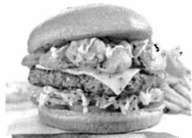
Crispy Jalapeño Burger