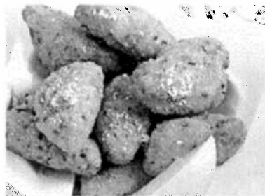
Crispy Fried Artichokes